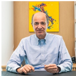
Corrado Passera Illimity

Some of our interviews with industry professionals: