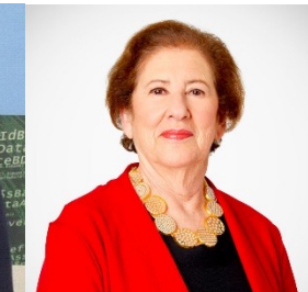
Betsy Cohen Bancorp